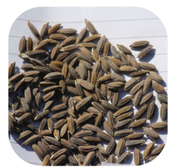
Red Paddy ( Oryza sativa )