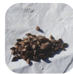
Buckwheat ( Fagopyrum esculentum L.)