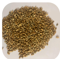
Barley ( Hordeum vulgare )

Barley ( Hordeum vulgare ) and black pea ( Pisum sativum ssp. arvense )