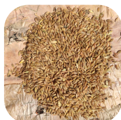
Uwa Jau ( Hordeum himalayense rittig)