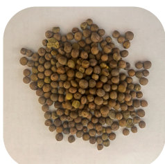
Black Pea ( Pisum sativum ssp. arvense )