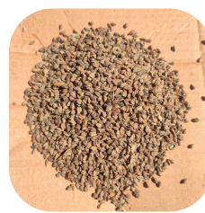
Buckwheat ( Fagopyrum tataricum L.)